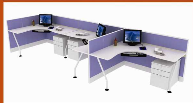
above | MGR 2 persons semi free standing desk - P80 + P8 NEST panel with spider leg support below | staff 3 persons - P80 & P40 NEST panel with spider leg support